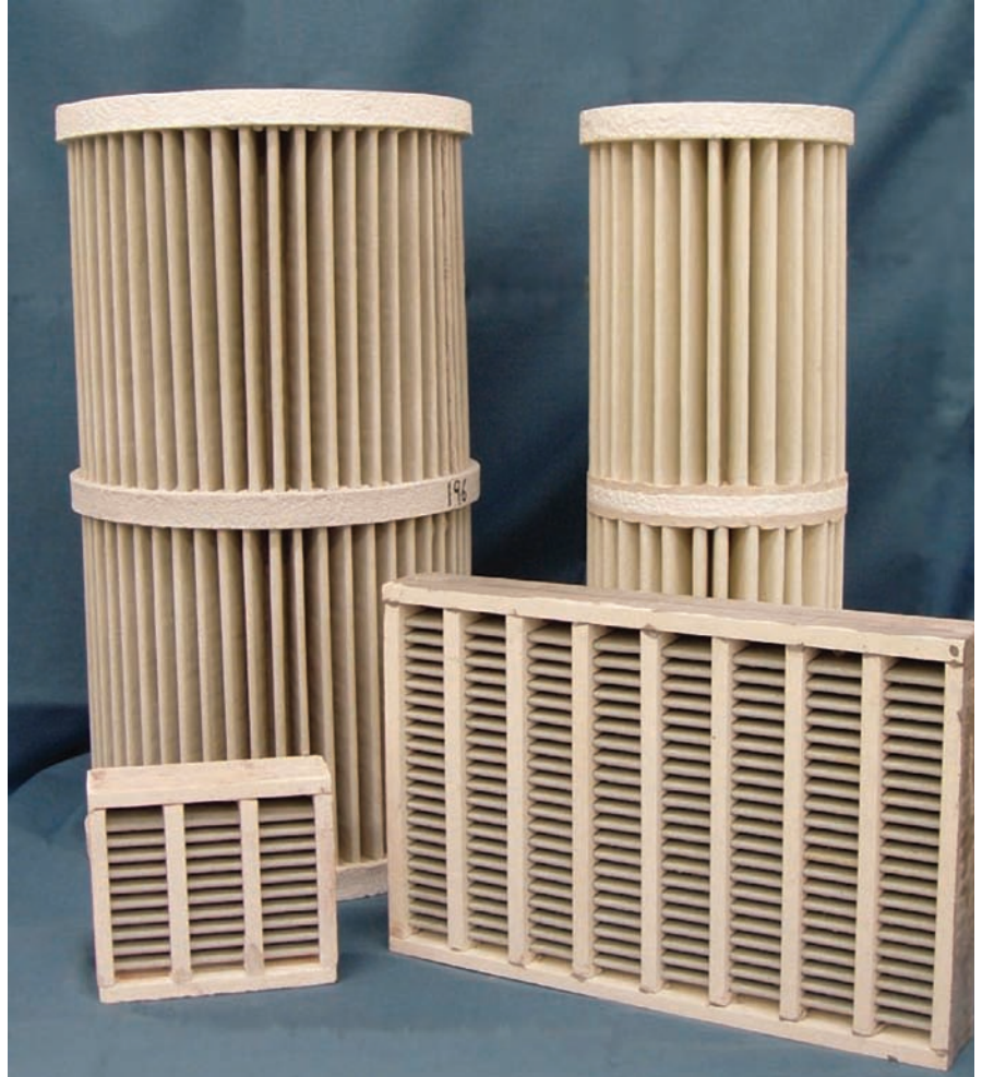
Pleated ceramic nonwoven filters from CerX Filters LLC

France-based Saint-Gobain S.A. has been making its SHEERFILL ® architectural membranes for more than 40 years. Over these four decades, it has developed and introduced new products to meet the changing needs of the structural membrane market. These innovations include membranes in different weights and strengths to better suit the demands of various structures; acoustical membranes for interior applications to reduce noise and reverberation; mesh materials for breathable façades; and even true self-cleaning action with the advent of EverClean ® photocatalytic top-coat, which incorporates titanium dioxide to reduce nitrogen oxide and sulfur oxide pollution while keeping the surface clean and bright.