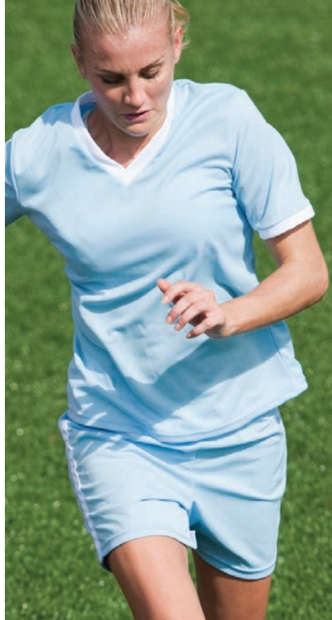
Garments featuring Crypton's Wick + Block® apparel technology